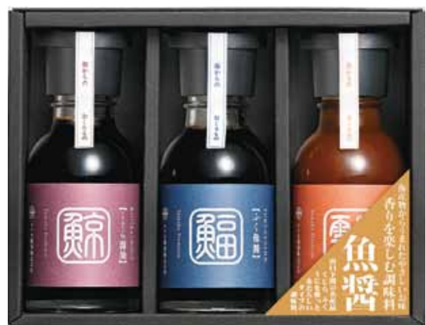
Fig. 1 Novel Fish Source Left: whale Middle: puffer fish Right: sea urchin

Recently, various fish sources are made from unused fishery resources with KOJI 23/24 . For example, puffer fish meat, whale meat, and sea urchin gonads. These resources are the processing residue from the seafood industry. The flavor of these fish sources using KOJI are different from the non-using KOJI , then the flavor of these fish sources using KOJI decrease the characteristic flavor of the non-using KOJI . However, these fish sources tastes good. Especially, the puffer fish sauce has a stronger antioxidative activity than the other fish and soy source 23-25 . Therefore, these fish sources have already been sold (Fig. 1).