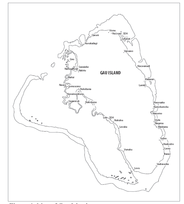
Figure 1. Map of Gau Island.

Gau Island is situated about 90km on the northeast from the capital city of Suva in Fiji' s main island, Viti Levu. It