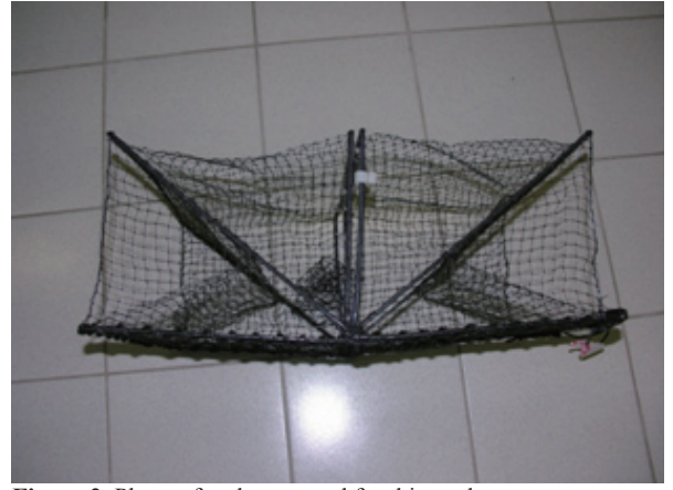
Figure 2. Photo of crab trap used for this study.

In the preliminary study, we found that crab trap measuring 80x60x25 cm brought from Japan can catch mangrove crab very efficiently and that the abundance of crabs depend on not only the presence of large mangrove forest but also rivers. For example, in Levuka where only small patches of mangrove forest are found, only few mangrove crabs were caught. According to the survey results, the island's coast can be divided into